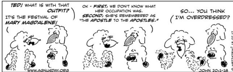
MARY MAGDALENE 22nd. July 2018

The apostles returned from their mission. They gathered around Jesus, and told him all that they had done and taught. He said to them, 'Come away to a deserted place all by yourselves and rest a while.' For many were coming and going, and they had no leisure even to eat. And they went away in the boat to a deserted place by themselves. Now many saw them going and recognized them, and they hurried there on foot from all the towns and arrived ahead of them. As he went ashore, he saw a great crowd; and he had compassion for them, because they were like sheep without a shepherd; and he began to teach them many things. When they had crossed over, they came to land at Gennesaret and moored the boat. When they got out of the boat, people at once recognized him, and rushed about that whole region and began to bring the sick on mats to wherever they heard he was. And wherever he went, into villages or cities or farms, they laid the sick in the market-places, and begged him that they might touch even the fringe of his cloak; and all who touched it were healed.