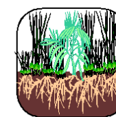
The Weedy Soil