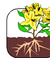
The Good Soil