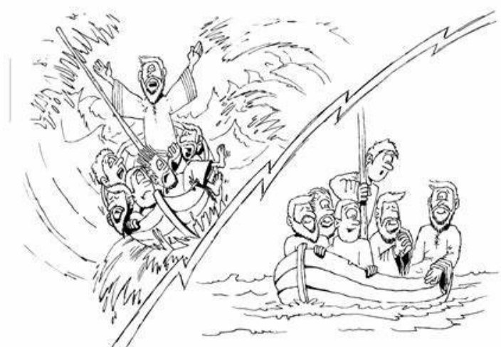
Matthew 08 - Jesus calms a storm

O Wisdom, your power is unlimited and unceasing. Call us, wake us, bring our imaginations to and for life. Push us. Move us. Remove the barriers of our apathy and fill us with the courage to act with your guidance, and to trust in the wise and powerful Spirit that made and loved creation. Amen.